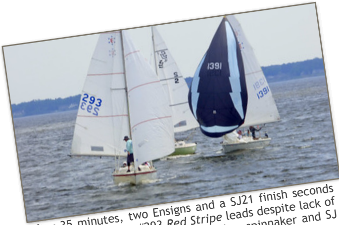
After 35 minutes, two Ensigns and a SJ21 finish seconds apart on April 25th. #293 Red Stripe leads despite lack of a chute, followed by Long Shot with a spinnaker and SJ Deuce's Wild.