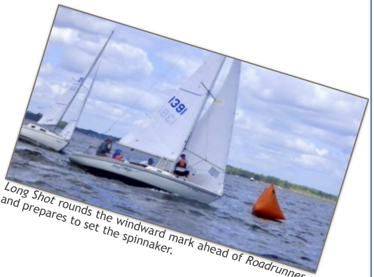
Long Shot rounds the windward mark ahead of Roadrunner and prepares to set the spinnaker.