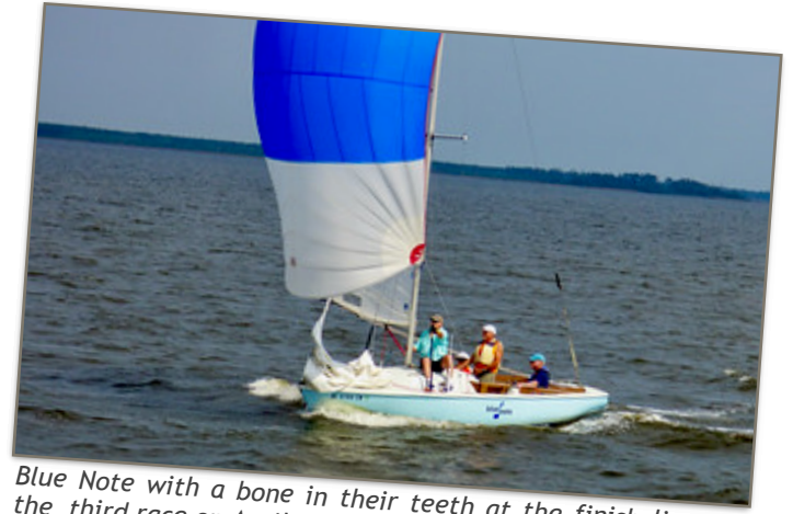
Blue Note with a bone in their teeth at the finish line of the third race on April 25th.