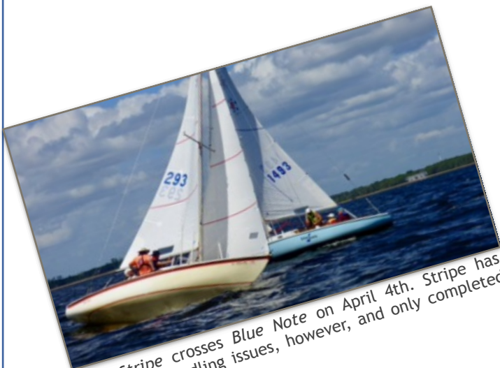
Red Stripe crosses Blue Note on April 4th. Stripe has some sail handling issues, however, and only completed one race that day.