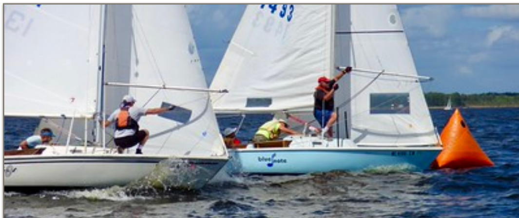
Blue Note rounds just inside Long Shot as both prepare to set chutes.